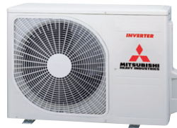
SRC20ZS-W, SRC25ZS-W2, SRC35ZS-W2