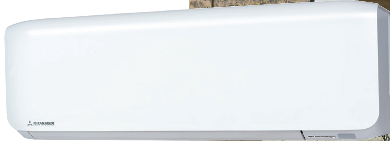
SRK20ZS-WF, SRK25ZS-WF, SRK35ZS-WF, SRK50ZS-WF